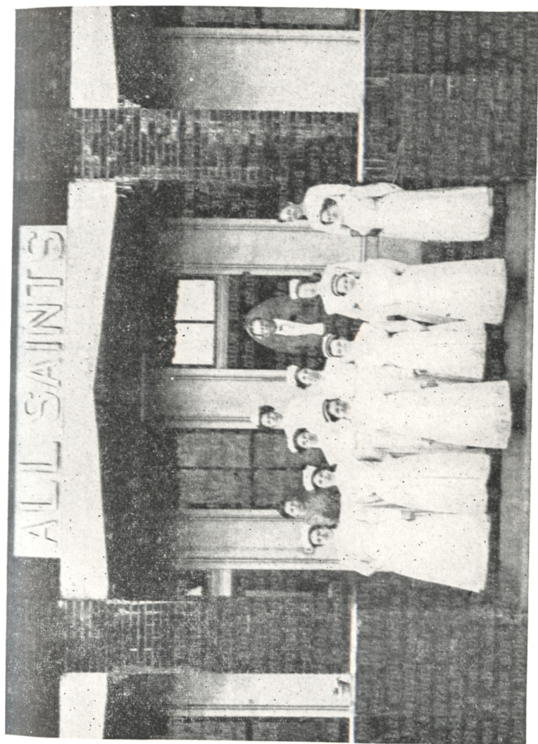
ALL SAINTS HOSPITAL A part of the staff about 1923.