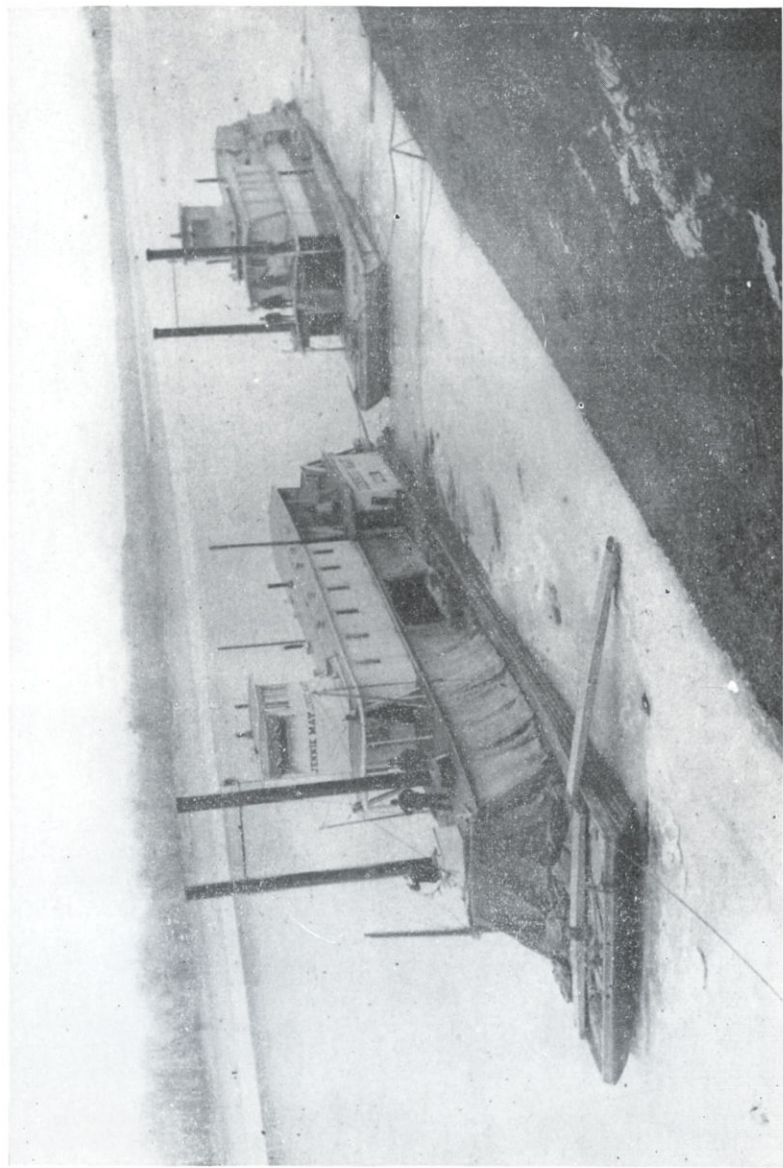
Steamboats on the Arkansas River at Webbers Falls, in the Early 1880's.