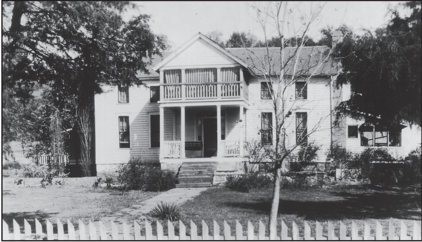
Will Rogers birthplace near Oologah, Oklahoma (1981,).

rebuilding both a beleaguered town and hundreds of shattered families and lives faced the people he met daily. Ladysmith gave Will Rogers a rare and close view of fresh and brutal history. Undoubtedly, social, political, and cultural attitudes were absorbed and were critical in forming his ability to make contributions that would enrich human understanding through his use of the media of show business. The South African experience enriched his perspective that appeared in his career as a journalist or news pundit. From the South African roots grew Will Rogers's tools for the broad venue of communications that he would spread beyond the circus tent on the wild west show in Madison Square Gardens, vaudeville, the Ziegfeld Follies, Broadway, newspaper and radio commentary, and stardom in cinema.