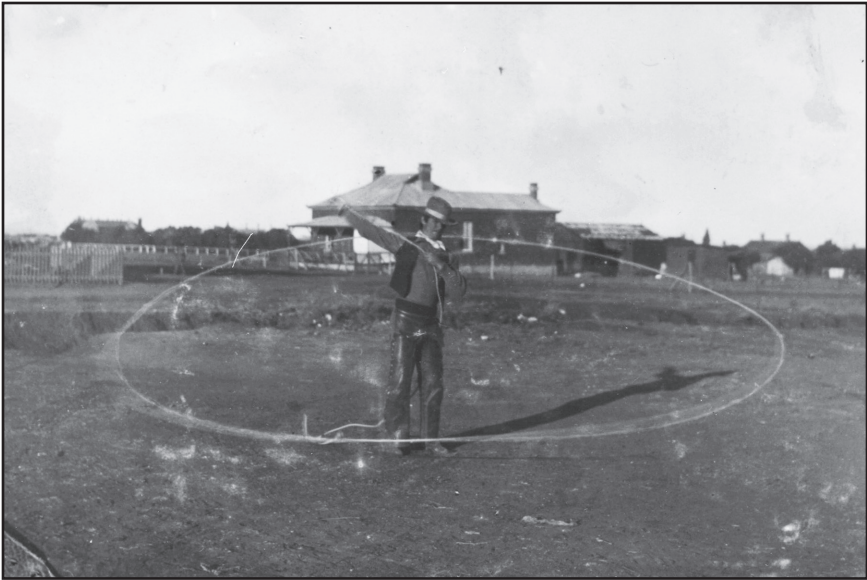
Will Rogers in Bloemfontein, South Africa.