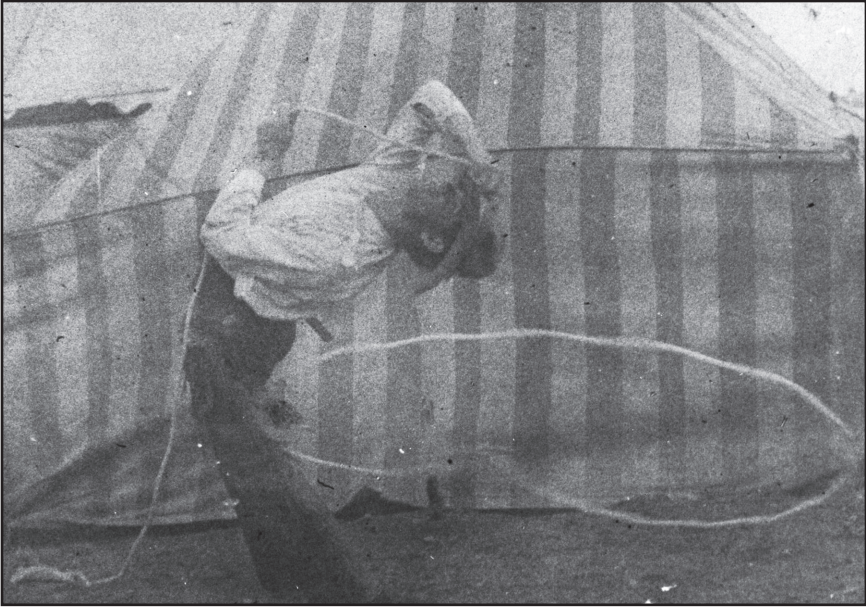
Will Rogers with Texas Jack's Wild West Show in Kroonstad, South Africa.

Rogers's arrival at Durban and surely was the current topic of conversation in December 1902 at the most grisly battlefield: Ladysmith.