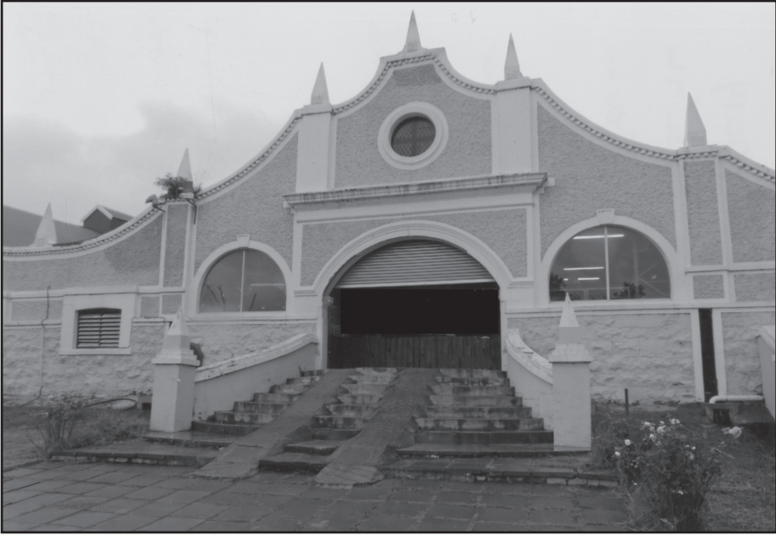
The stables at Greenfields.