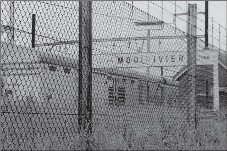
Mooi River, South Africa (photograph courtesy of the authors).

Drakensberg Mountains. While the port is at sea level, Mooi River is eighty-eight miles north and nearly a mile high.