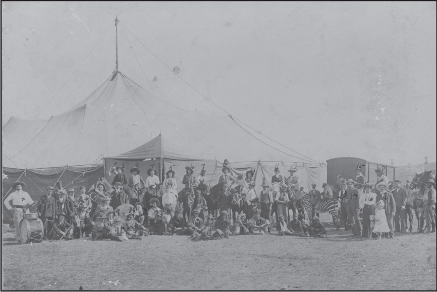
Texas Jack's Wild West Show cast.

to India during the third week of October 1901, and Will Rogers arrived in August 1902.