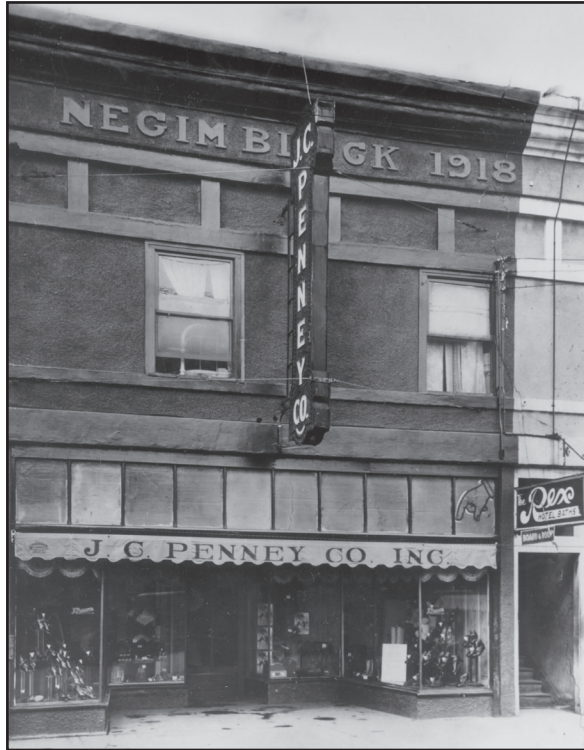
Picher J.C.Penney store, 1926.