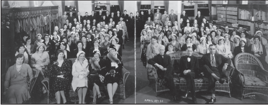
J.C. Penney visiting local associates inside the Enid store, 1931.

Throughout the Depression Penney found visiting J.C.Penney stores to be a therapeutic distraction from his personal problems. He also believed that his presence inside local stores could be therapeutic for his associates and customers. As an agriculturalist he additionally hoped his visits could bring him insight into how economic and agricultural conditions in the Midwest could be improved, since most of his locations were operating there. In spring 1931 Penney set aside three weeks to visit J.C.Penney stores in the region. As he made his way through Oklahoma, he spent considerable time visiting stores in the northeastern part of the state, as well as a stretch of his stores from Enid to Ardmore, walking through sales floors, talking to managers and associates, interacting with local customers, and inspecting sales records and stock room inventories. Penney visited his locations in Miami, Picher, Claremore, Vinita, and Perry before making his way west to Enid.