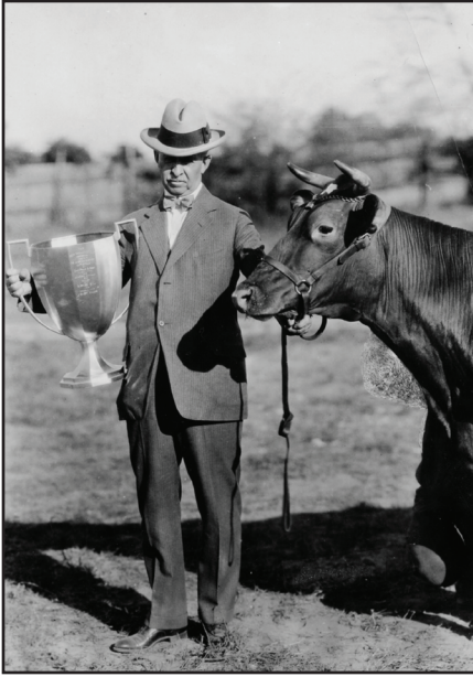
Penney poses with his prize-winning Guernsey cow, 1928.

Ironically, opening a J.C.Penney store in Tulsa was somewhat of an aberration for the J.C.Penney Company, as the majority of Penney's early locations were typically in smaller Oklahoma communities. While the company operated stores on the main streets of regional trade centers like Bartlesville, McAlester, Lawton, and Enid, J.C.Penney stores also did business in towns as small as Barnsdall, Hominy, Madill, and Okemah. The initial rural character of J.C.Penney store locations was consistent with the character of James Cash Penney himself. Despite his own metropolitan setting in New York City, not to mention his eloquent command of the English language and fashionable taste in apparel, Penney remained a country boy at heart, and he easily identified with the needs of rural people and the small-town working class. Three years after moving to New York City Penney began to embrace farming and ranching as a second career, studying the breeding of both beef and dairy cattle on farms he acquired in New York, Florida, and his native Missouri. Even his work in agriculture was based on the golden rule: Penney believed that creating better cattle for farmers and ranchers would help bring them greater prosperity, which in the long run would bring prosperity to the J.C.Penney stores that served their rural areas. 20