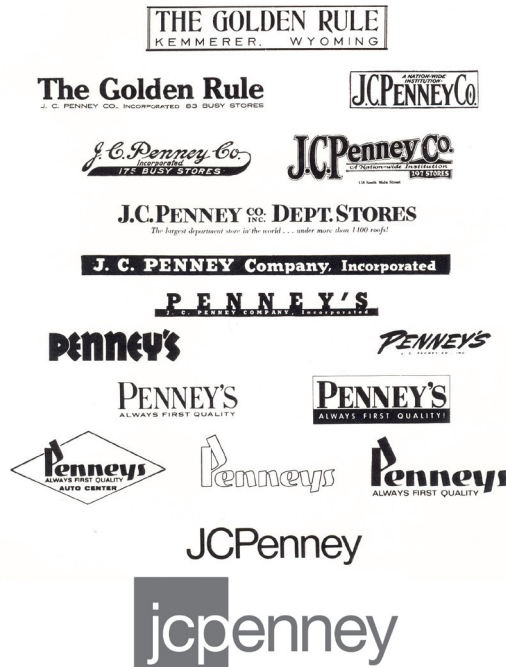
Evolution of J.C. Penney logos, 1902-2011.