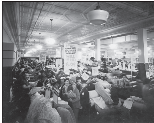
Interior of the downtown Oklahoma City J.C.Penney store at 303 Main, 1935.

By 1934 J.C.Penney sales nationwide had finally begun to exceed their 1929 levels. 29 Ironically, Penney’s personal financial recovery had come about from the generosity of his own associates, who had heard